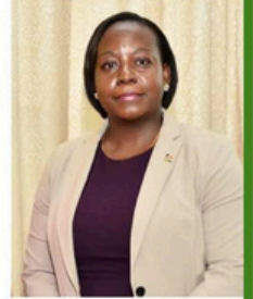
Minister Marie-May Jeremie

This year’s theme, “Forests and Economies,” reminds us that forests are not only ecological treasures but also vital drivers of sustainable livelihoods and national prosperity.”